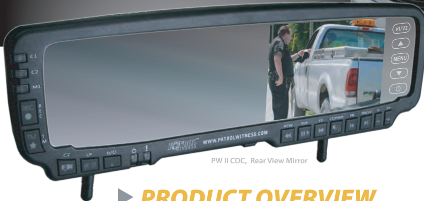
PW II CDC, Rear View Mirror